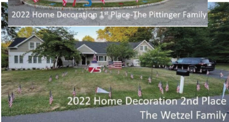
2022 Home Decoration 2nd Place The Wetzel Family