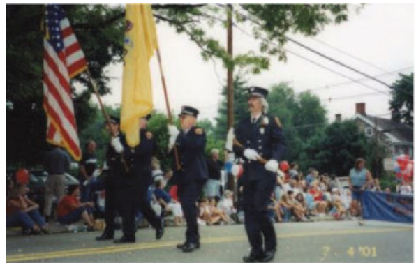
Lebanon Boro Fire Department