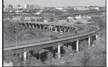
NJ Turnpike East Viaduct