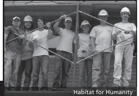
Habitat for Humanity