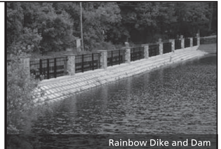
Rainbow Dike and Dam