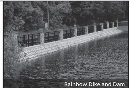
Rainbow Dike and Dam