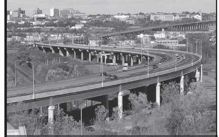
NJ Turnpike East Viaduct