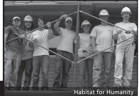
Habitat for Humanity